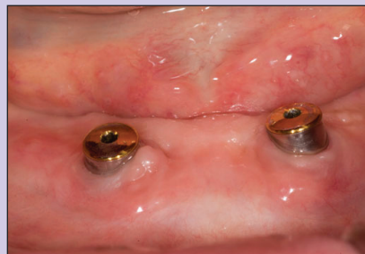
Figure 1: Clinical appearance 1 year after attachment of denture with magnets.

We present here a preliminary 1-year clinical report from a case series of implant-retained dentures, in which the benefits and limitations of a rare-earth magnetic system (MAGFIT) were monitored. The primary objective of the study was to determine the satisfaction of patients who used complete dentures retained by rare-earth magnets supported on 2 implants in the mandible. Approval to test the magnet system was obtained from Health