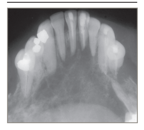
Figure 2: This 64-year-old man had prostate carcinoma metastatic to the anterior mandible. There are multiple radiolucencies bilaterally, some of which mimic periapical disease.