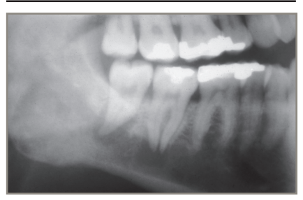
Figure 3: A 32-year-old woman had metastatic deposits of breast carcinoma at the apices of the mandibular molars that mimicked periapical inflammatory disease.