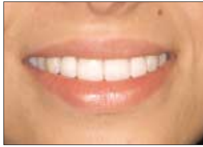
Fig. 4b: Post-operative photograph of the restored single-tooth implant at site 12.