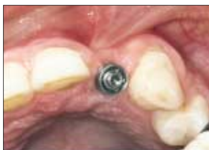
Fig. 3b: Post-operative photograph of the restored single-tooth implant at site 22.