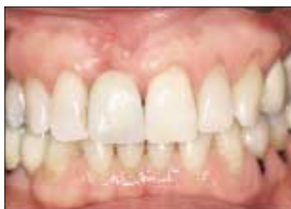
Fig. 2b: Post-operative photograph of the restored single-tooth implant at site 11.