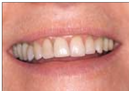
Fig. 2c: Photograph of the full smile of the patient showing the completed result of restored implant at site 11.