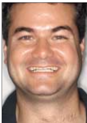
Fig. 3c: Photograph of the full smile showing the completed result of restored implant at site 22.