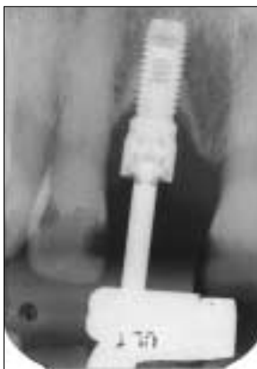
Fig. 2d: Periapical radiograph of the implant at site 11.

Four (13%) of the 30 implants had contact in centric occlusion. Seven (23%) of the implants had contact in lateral and protrusive excursions. Abutment reflection (seen as a grey shadow) under the soft tissue was noted with 7 (23%) of the implants, whereas 8 (27%) had a soft-tissue deficiency. Gingival tissue around 3 (10%) of the implants showed signs of inflammation. None of the implants was associated with fistulae, dehiscence or mobility. Twenty-three implants (77%) had mesial interproximal contact with the adjacent tooth, and 25 (83%) exhibited distal contact. Loose gold screws were found in 4 (13%) of the crowns, but all had gone unnoticed by the patients. No looseabutment screws were observed.