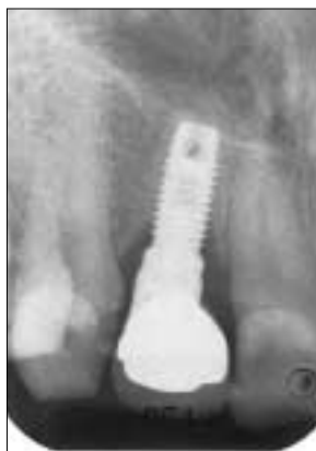
Fig. 3d: Periapical radiograph of the implant at site 22.

tion in the prevention of occlusal overload on implants is that of tactile sensitivity, which is reportedly 3 times less on implants than on teeth. 12 Although 7 implants had occlusal contacts in centric occlusion or excursions, only one patient with such contacts reported the use of an occlusal splint at night. The loading limits of a single implant in different host sites in the jawbones are not known. Long-term success for multiple splinted implants cannot be extrapolated to single implants. Hence the dentist must be particularly prudent in planning single-tooth implants in the context of anticipated differences in magnitude, frequency and duration of forces acting on the replaced single crown. The premise of treatment planning in the IPU has been to “protect” the single implant as much as possible by minimizing or even precluding occlusal contacts on the crown in both centric contact and excursive positions. In fact, the single implant is regarded more as an elegant and ecologically sound space maintainer than as a crown replacement. The comparison of full loading, partial loading and no loading for single implants at different jaw sites and over longer periods of observations clearly deserves investigation.