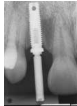
Fig. 4c: Periapical radiograph of the implant at site 12.

inflammation, although one patient reported dissatisfaction because of abutment reflection under the gingiva. 17 Fistulae have been reported in association with loose abutment screws. 10,13 However, neither fistulae formation nor loose abutment screws were observed in the current study.