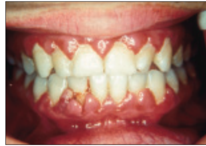
Figure 1 : Severe gingivitis in pregnant patient.

acetaminophen for minor pain during pregnancy. For more severe pain, a narcotic analgesic such as acetaminophen with codeine may be given in minimal doses, especially in the first trimester.