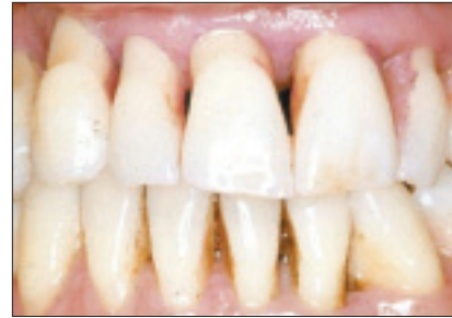
Figure 1: Patient shows signs of generalized gingival recession exposing significant amounts of dentin. The exposed dentin demonstrates the typical effects of surface loss due to both erosion and abrasion.

Failure to consider causation in the management of dentin hypersensitivity may result in failure of treatment. All etiological and predisposing factors, particularly related to erosion and abrasion, must be investigated. Consideration should be given to obtaining a detailed, written dietary history in order to identify acidic foods and beverages. Oral hygiene habits — frequency, duration and timing, especially in relation to acid exposures, and brushing technique and force — and the appearance of the brush when it is changed should be taken into account.