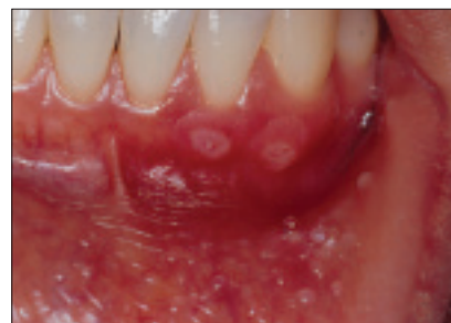
Figure 2: Oral ulceration 10 minutes after application of Orabase Soothe-N-Seal.

20%), Anbesol Liquid (benzocaine 6.4%), Anbesol Gel (benzocaine 6.4%), Orajel Mouth Sore (Del Pharmaceuticals), Kank-A (Blistex Inc.) and Hurricaine Liquid and Gel (Beutlich Pharmaceuticals).