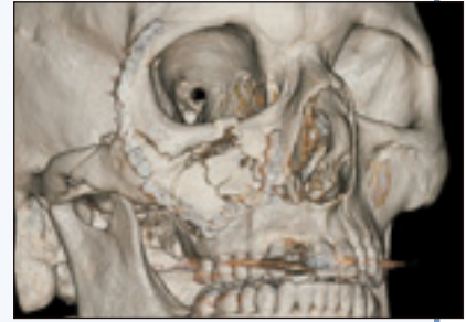
Figure 3: Three-dimensional CT scan demonstrating reduction and fixation of a right zygoma fracture completed through multiple approaches.

long-term effects on vision. If there are any visual defects, consultation with an ophthalmologist is indicated. Palpation of the bony margins of the orbit for step deformities will indicate the point of fracture. Nasal examination should include an assessment of symmetry, dorsal deformity and intranasal obstruction.