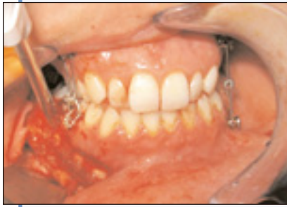
Figure 4: Maxillomandibular wire fixation in a 13-year-old patient with a right mandibular body fracture fixed with a resorbable plate.