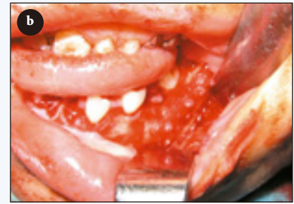
Figure 5: Preoperative (a) and postoperative (b) views of resorbable fixation of a left mandibular body fracture in an 8-year-old patient.

Maxillary fractures are not common in children unless the maxillary sinus is present. 5 Closed reduction and maxillomandibular fixation for 2–3 weeks can be used to treat minimally displaced fractures. If open reduction is used, care must be taken to avoid damage to unerupted teeth from inappropriately placed screws.