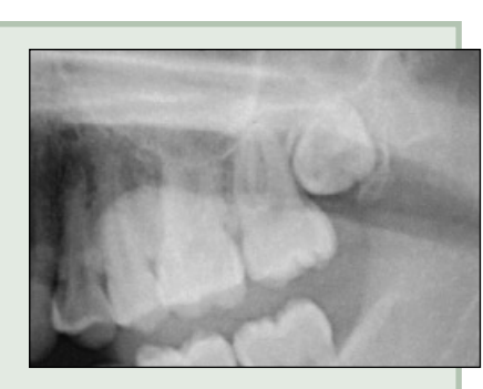
Figure 3b: A preoperative panoramic radiograph shows the original position of tooth 28.