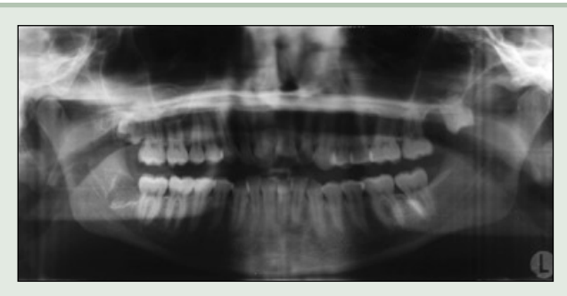
Figure 3a: A panoramic radiograph is a useful baseline tool to demonstrate the location of the displaced maxillary third molar, in this case tooth 28.