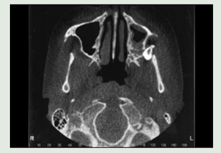
Figure 4: Axial computed tomography image shows the position of the displaced tooth 28 seen in Fig. 3.