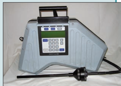
Figure 4: The Miran Sapphire infrared spectrometer used for air sampling to determine nitrous oxide levels in this study.

the expired waste gases by constant suction, transferring gases for dilution to an external environment (Figs. 2, 3a and 3b). Evaluation of the ability of scavenging systems to reduce operators' and auxiliary staff's exposure during N 2 O/O 2 sedation has demonstrated that not all systems are equally effective. 6-15 The Porter/Brown scavenger mask system (Porter Instrumentation Company, Hatfield, Penn.) achieved a greater reduction in ambient N 2 O levels than other systems when tested during a standardized mock dental treatment protocol designed to reflect clinical practice. 15 However, continuous or real-time monitoring of N 2 O levels for occupational exposure limits in an actual pediatric clinical environment has not been evaluated.