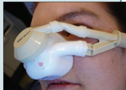
Figure 2: The Matrix Medical single-mask scavenging system in place with the external valve scavenging core.