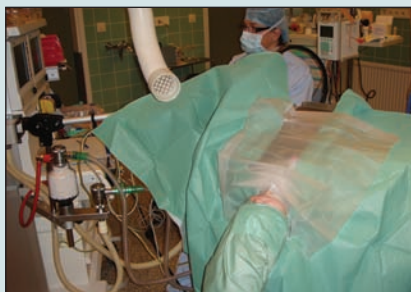
Figure 1a: In some hospital settings, scavenging systems that are external to the anesthetic equipment may be used to collect waste anesthetic gases.