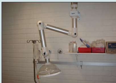
Figure 1b: In some recovery rooms, hoods such as the one pictured here connected to a vacuum are used to collect waste anesthetic gases after anesthetic procedures.