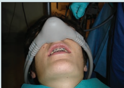
Figure 3a: The Porter/Brown double-mask scavenging system in place.