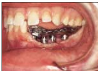
Figure 2b: Interarch space allowed for use of stock prosthetic teeth attached to a silver-palladium framework.