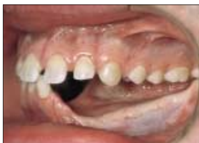
Figure 2a: The left mandibular dentition and its supporting tissues were lost after surgical resection for treatment of a tumour. The grafted site hosts 4 long implants placed in an offset manner to optimize lateral stress resistance.