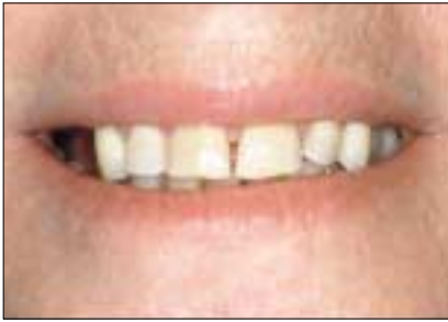
Figure 1a: Patient's smile reveals missing teeth in quadrant 1.