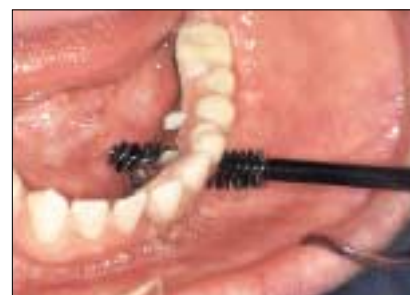
Figure 2c: The casting technique is similar to the one used when designing saddle areas for removable partial dentures. The favourable circumoral activity allows for generous space under the pontics and around the implant abutments for maintenance of hygiene.