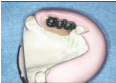
Figure 1c: After a try-in with prosthetic teeth, an index is made and then used to guide the technician's wax-up of a cast frame.