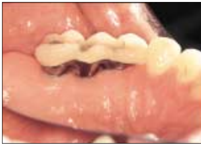
Figure 1d: A metal and ceramic fixed partial denture was selected because of restricted interarch space.

if the quantity of the remaining bone was insufficient to accommodate an implant measuring 10 mm long and 3.75 mm in diameter. 8 The problem of insufficient bone occurred infrequently, in patients with advanced resorption of the residual ridge and unfavourable proximity of pneumatized contents of the sinus or inferior alveolar canal. The implant dimensions mentioned were those of implants available at the beginning of the study. Subsequent availability of implants 7 mm long enabled their use as well. Treatment planning principles, which evolved on the basis of experience and published outcomes, led to the dual objectives of a minimum of 2 or 3 implants at each edentulous site and scrupulous occlusal prosthodontic designs, to optimize the distribution of anticipated stress.