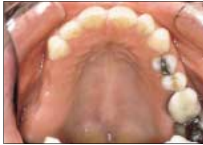
Figure 1b: The partially edentulous span in the right maxilla – occlusal view.