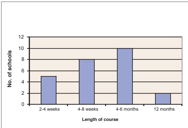
Figure 1: Duration of courses in esthetic dentistry in the 25 North American dental schools that had a special teaching program (group A).