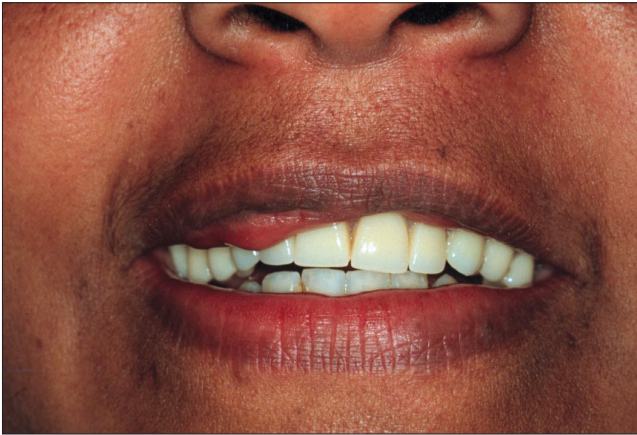
Figure 1: Initial aspect of the unilateral upper double lip.