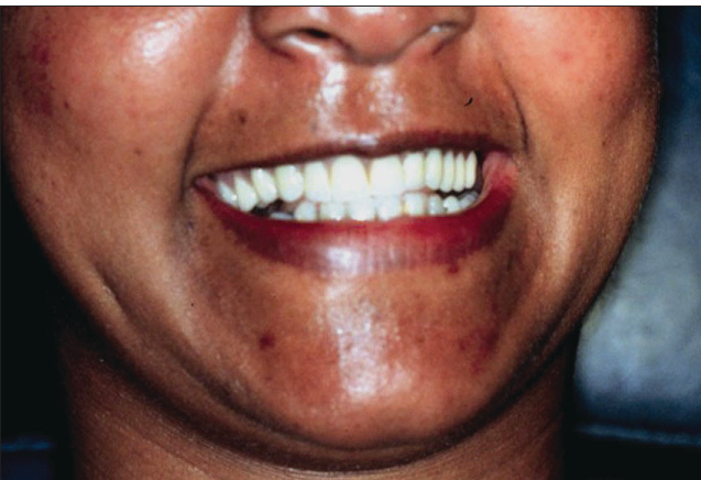
Figure 3: An 18-month follow-up photograph showing stable esthetic result.