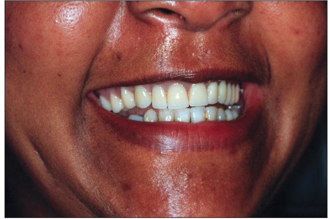
Figure 2: A 6-month follow-up photograph showing good esthetic result.