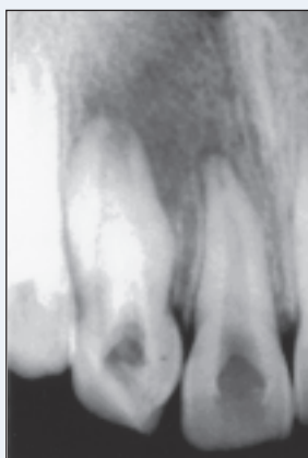
Figure 1: Preoperative radiograph of maxillary lateral incisor showing Type 3 dens invaginatus with periapical radiolucency.