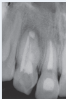
Figure 6: Radiograph taken at 3 months follow-up.