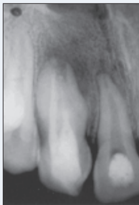
Figure 4: Immediate post-obturation radiograph.