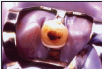
Figure 2: Access opening demonstrating 2 distinct canal orifices.