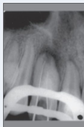
Figure 3: Radiograph with K-files in both canals.