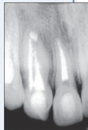
Figure 7: One year after treatment, the radiographic appearance of the periapical area is normal for both the central and lateral incisors.

teeth or if endodontic therapy and apical surgery have failed or are not possible. 10