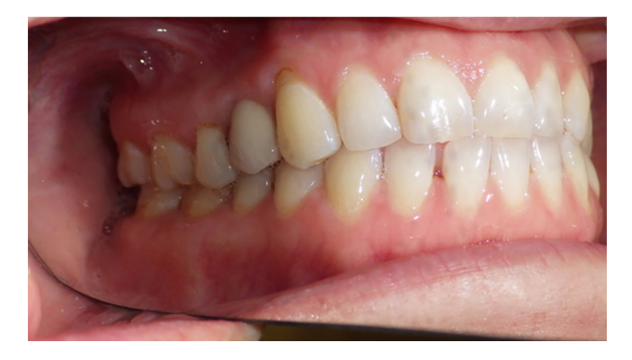
1(f) Post-implant photograph.