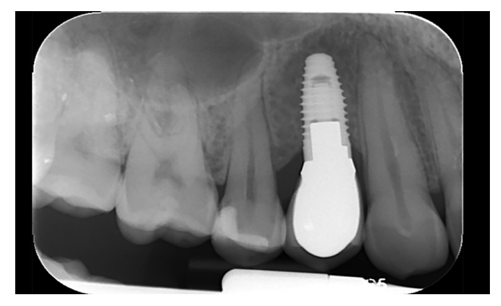
1(e) Peri-apical radiograph after implant.