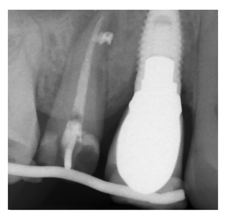
1(g) Follow-up radiograph taken 4 years post-implant.