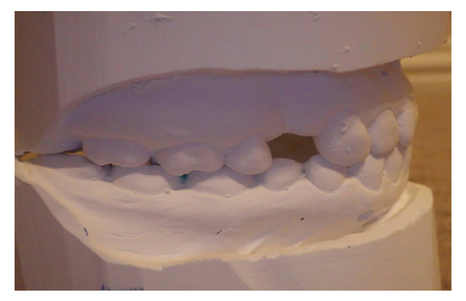
1(c) Pre-operative diagnostic cast.